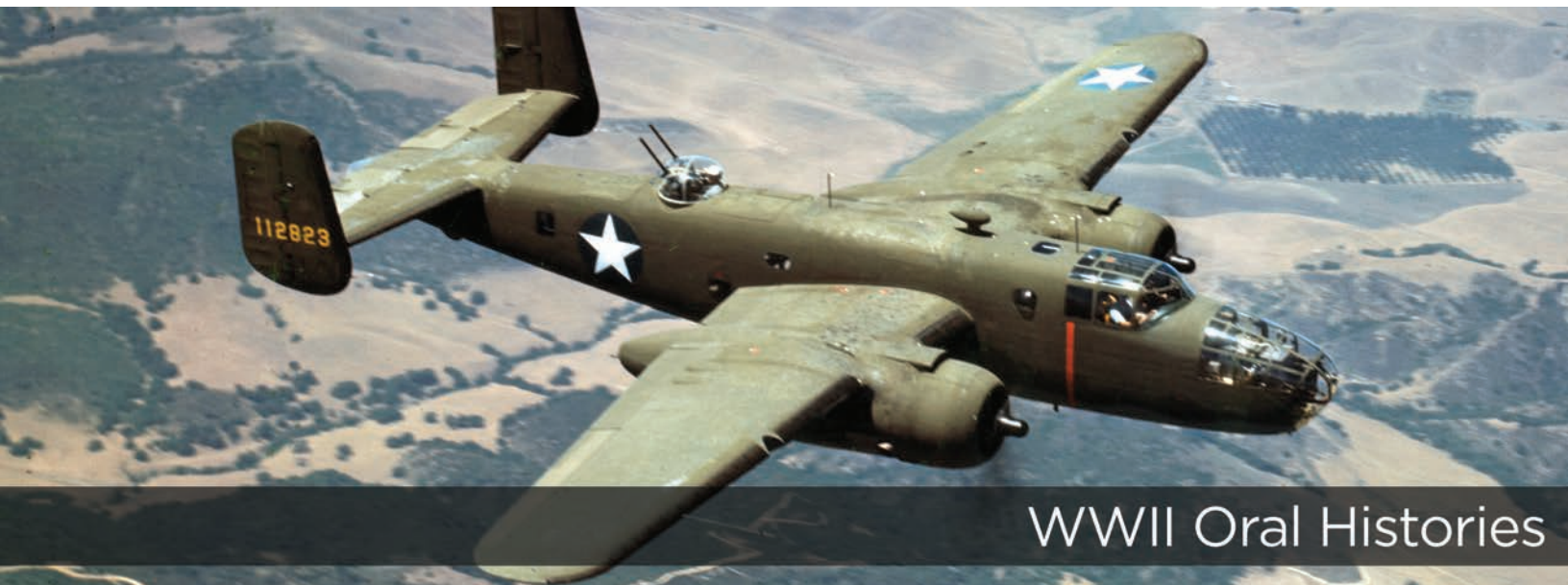
B-25 MEDIUM BOMBER